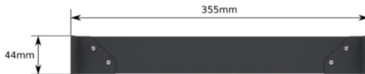
View - from above