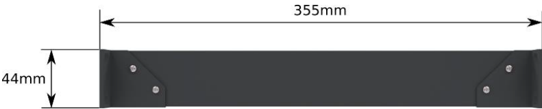
View - Side